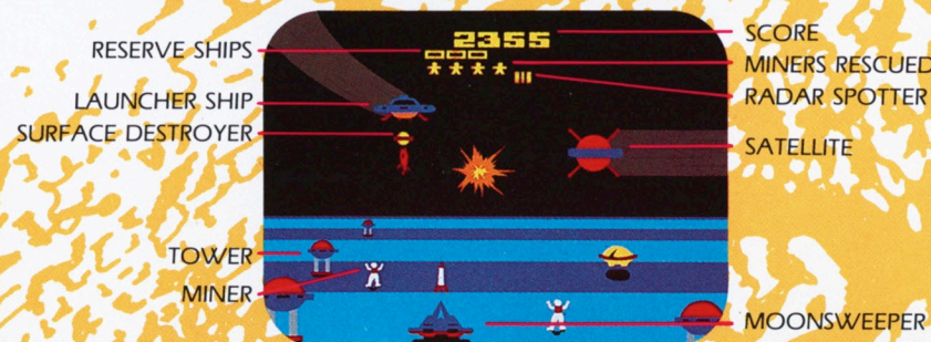
ON A MOON SURFACE

NOTE: ALL THESE OBJECTS MAY NOT APPEAR AT THE SAME TIME