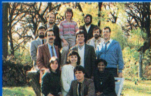
Adapted by The Game Weavers.