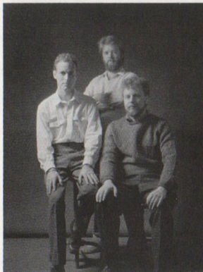
Adapted for Colecovision™ by Sydney Development Corp.